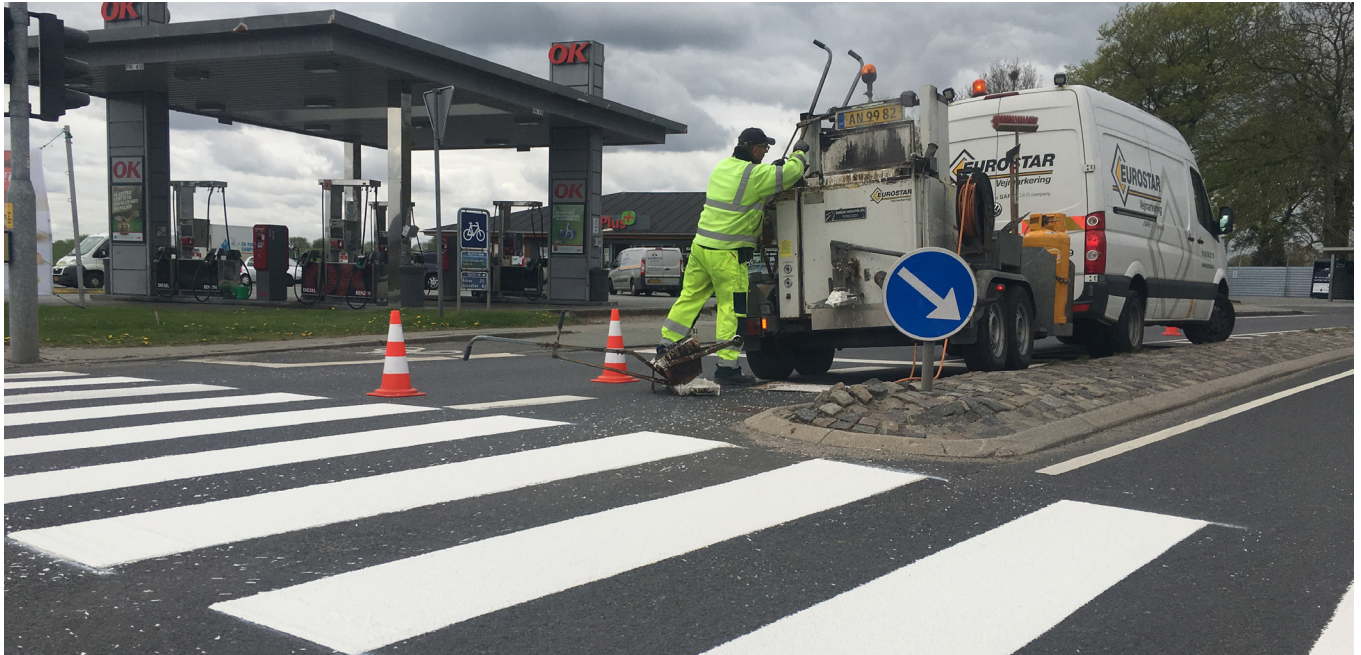
E.g. pedestrian crossing marking

Length: 3900 mm; width: 1850 mm; height depends on size of the chosen preheater.