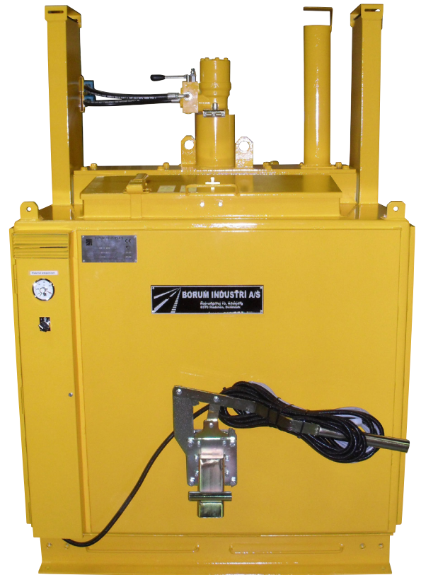
Direct preheater with 1 thermostat

The preheater is equipped with 1 thermostat for thermoplastic material temperatures from +50 to +270° C.