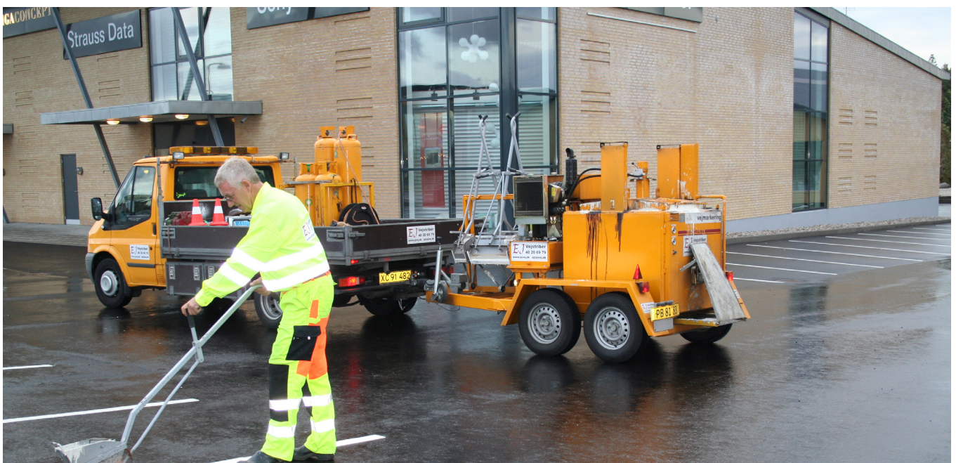
E.g. parking lot marking