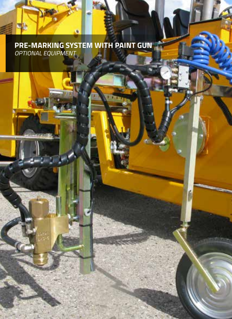
PRE-MARKING SYSTEM WITH PAINT GUN OPTIONAL EQUIPMENT