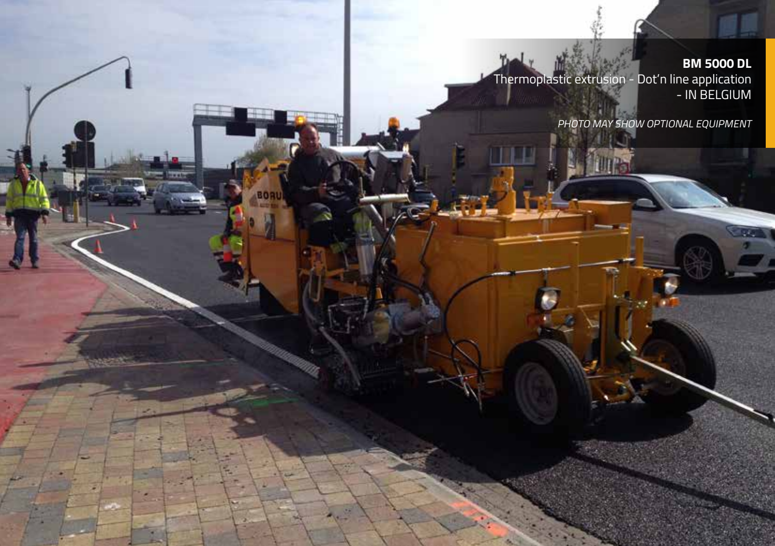
PHOTO MAY SHOW OPTIONAL EQUIPMENT

Thermoplastic extrusion - Dot'n line application - IN BELGIUM