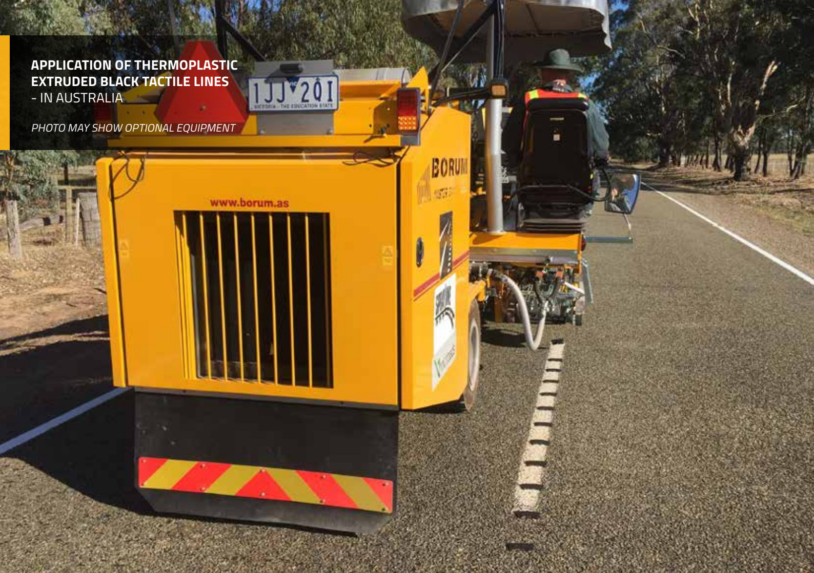
PHOTO MAY SHOW OPTIONAL EQUIPMENT