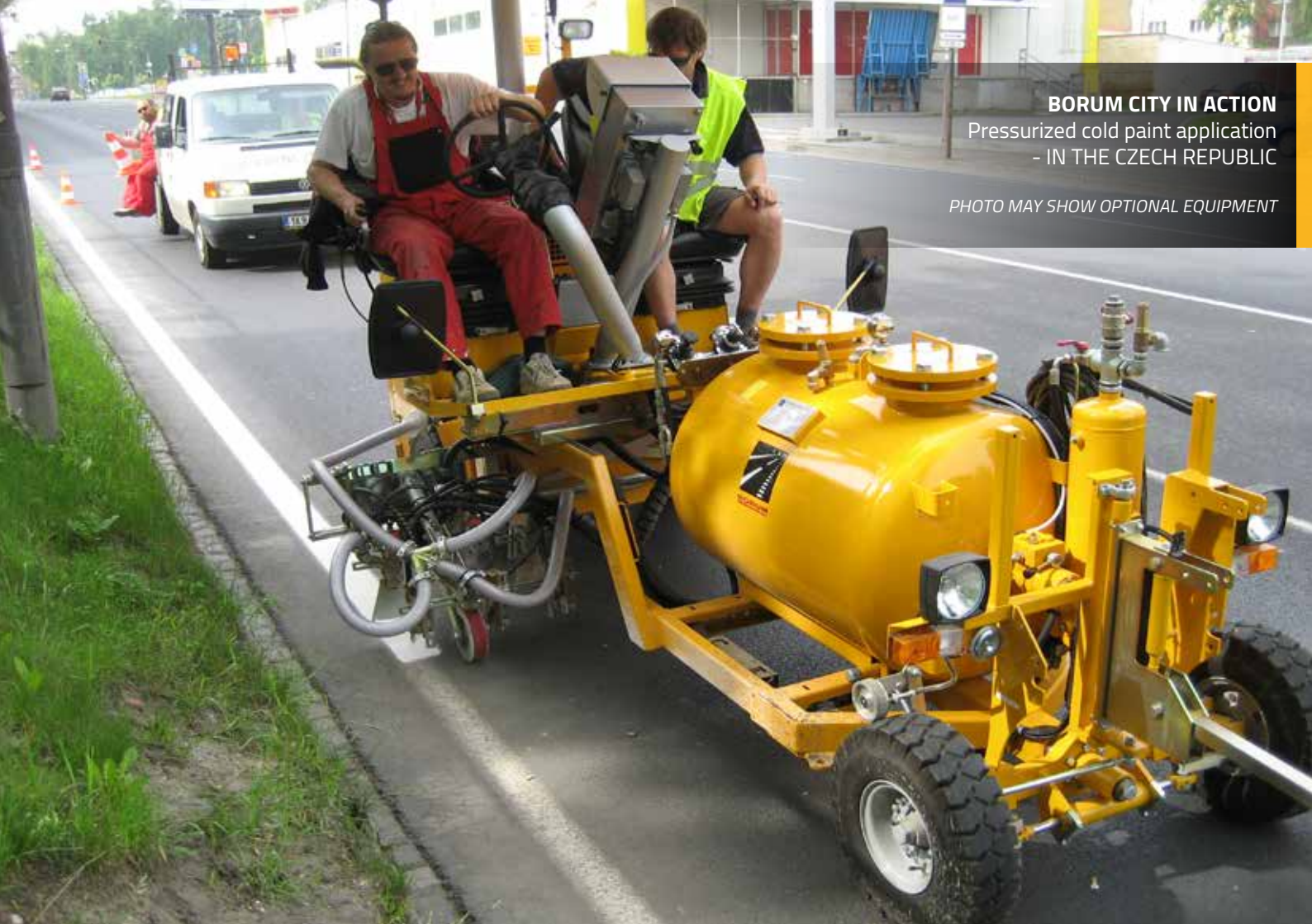
PHOTO MAY SHOW OPTIONAL EQUIPMENT

Pressurized cold paint application - IN THE CZECH REPUBLIC