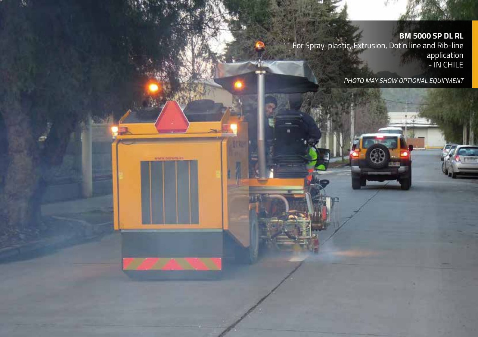
PHOTO MAY SHOW OPTIONAL EQUIPMENT

For Spray-plastic, Extrusion, Dot'n line and Rib-line application - IN CHILE