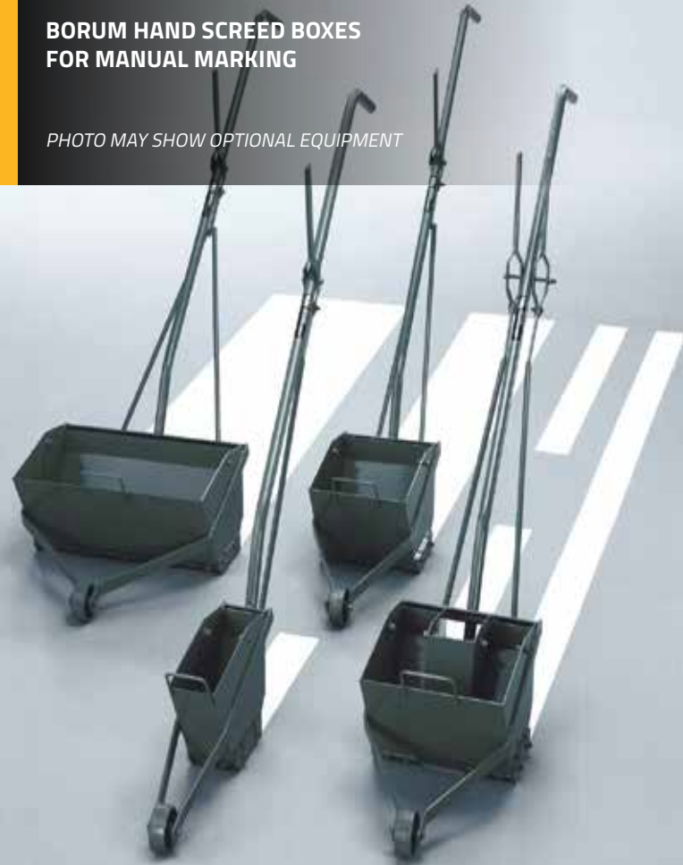
PHOTO MAY SHOW OPTIONAL EQUIPMENT