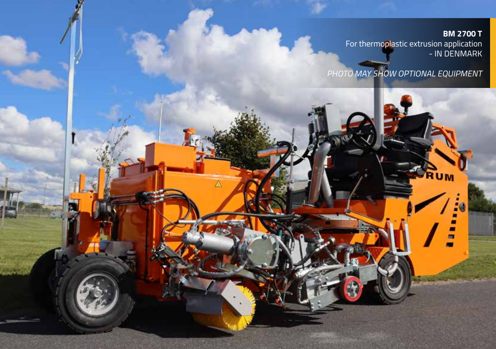
PHOTO MAY SHOW OPTIONAL EQUIPMENT

For thermoplastic extrusion application - IN DENMARK