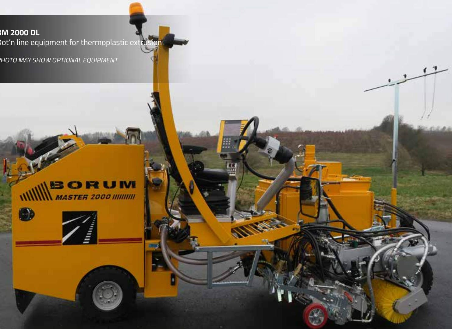
PHOTO MAY SHOW OPTIONAL EQUIPMENT

Dot'n line equipment for thermoplastic extrusion