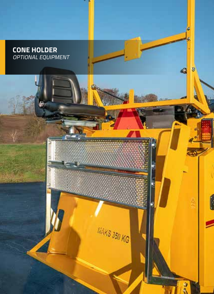
CONE HOLDER OPTIONAL EQUIPMENT