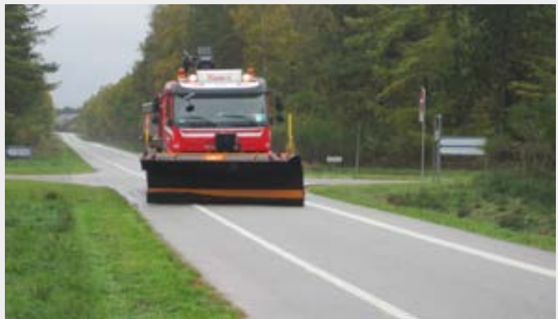
A snow plow machine conducting the test

It was agreed to carry out 10 runs with each of the three plows in the order A, B and C, corresponding to an increasing degree of wear on the road markings, and with a speed of 50 km/h. In addition, it was agreed that RL values are measured initially and repeated after use of each of the three plows.