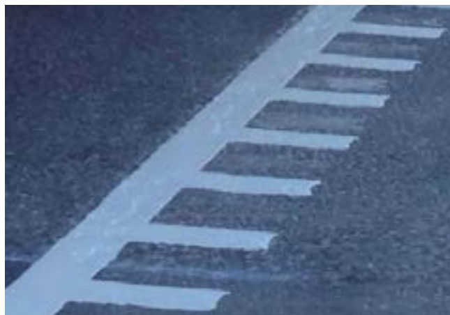
An example of an edge flex line type

Alternatively, if it's not an option to place the road markings in a milled track, then you can place a "sacrifice" line/guideline next to the profiled markings, to protect the profiles from the blade of the snow plow.