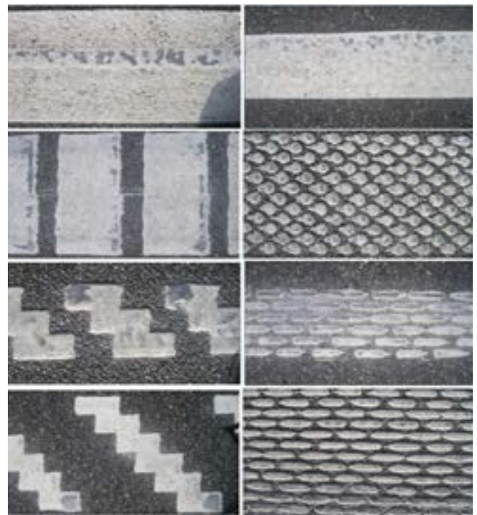
Road markings after the snow plow test

There was general agreement that the wear caused by plow A was weak . Additionally, there was no significant deposition of rubber on the surfaces of the road markings - presumably because of rain or wetness. The wear from plow B was judged to be stronger , plow C was clearly the strongest - there was a visible beam of abraded material from the plow during the runs, resulting in abraded material deposited around the road markings.