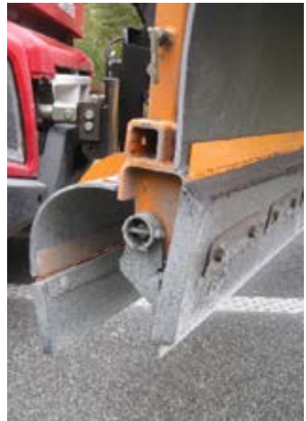
C - Hard metal blade

It was agreed to carry out 10 runs with each of the three plows in the order A, B and C, corresponding to an increasing degree of wear on the road markings, and with a speed of 50 km/h. In addition, it was agreed that RL values are measured initially and repeated after use of each of the three plows.