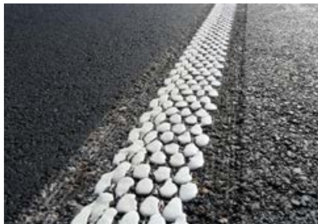
An example of a dotted line in a milled track

This way the road markings are physically protected from the blade of the snow plow. However, this solution is not always accepted, since the milling cuts open the asphalt, and as a consequence the life time of the road risks being affected.