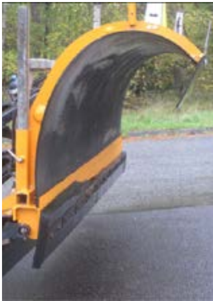
A - Rubber blade

For this testing, three different plows were used: A - Rubber blade; B - Steel/ceramic blade; C - Hard metal blade.