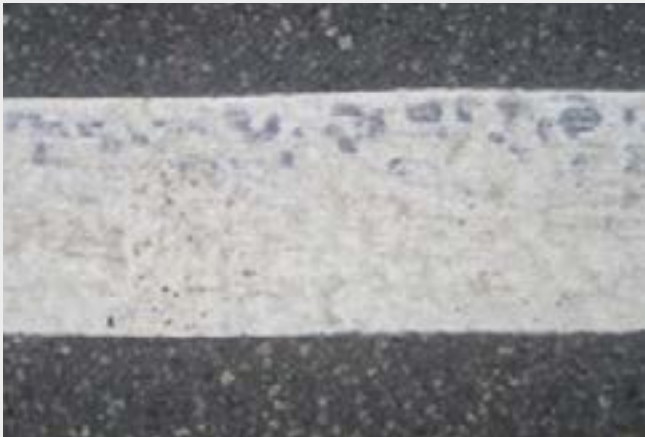
An example of a damaged continuous line

Consideration must be given to which methods are best suited to meet the functional requirements in a life expectancy analysis. The decision is subject to a cost/benefit assessment, and must of course be within the opportunities provided in the budgets. Important parameters to consider in this cost/benefit analysis are; the road marking material, the line types and the maintenance strategy.