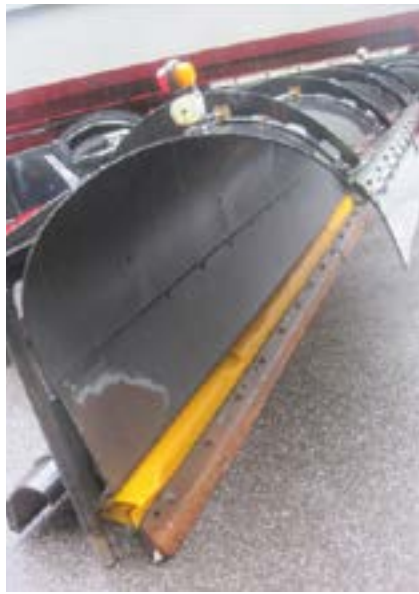
B - Steel/ceramic blade