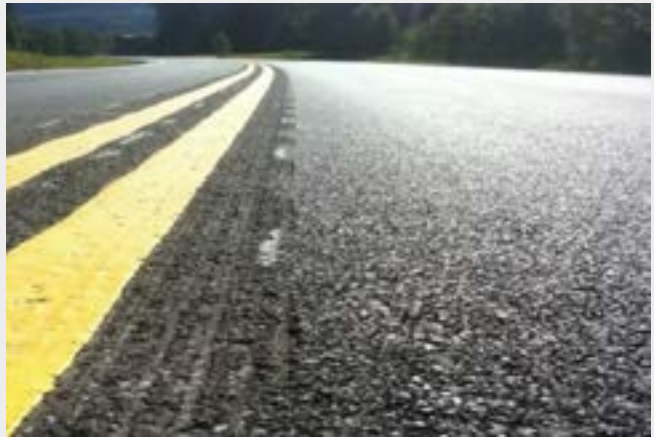
An example of a continuous line in a flat milled track