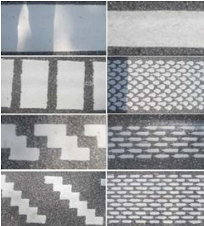
Road markings before the snow plow test