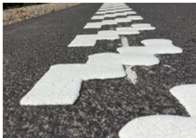
An example of a stair flex line type

This solution works best when the snow plow blades in rubber are used because snow plow blades in a harder material have a higher risk of damaging the whole line.