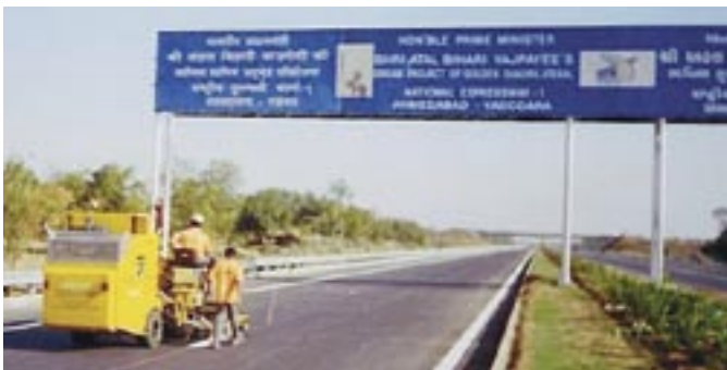
Mark-O-Line Traffic Controls at work in India

"We have very stringent performance requirements and need spe-