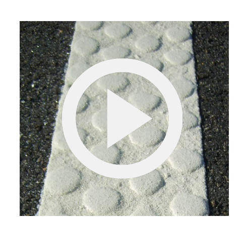
DOTS ON A BASE LINE